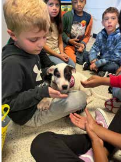
Puppies and students make a happy combination at Graniteville Elementary.

Thank you to educators that bring us into their schools and let us partner with them. If we ever want a solution for animal overpopulation and the countless stray animals wandering our roads, it is vital for this generation to learn about pet responsibility and caring for those that need help.